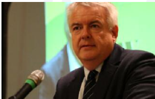
Carwen Jones, First Minister of the Welsh Assembly Government and Chief Guest, made a speech at the Centre's 10th anniversary celebration