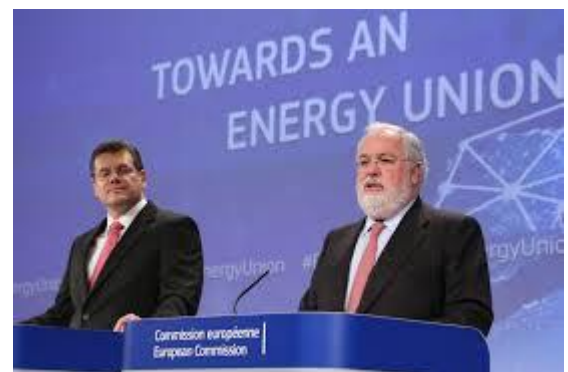
Vice President for the Energy Union Maroš Šefčovič and EU Commissioner for Climate Action and Energy Miguel Arias Cañete.

The full press release is available on the FOSG website .