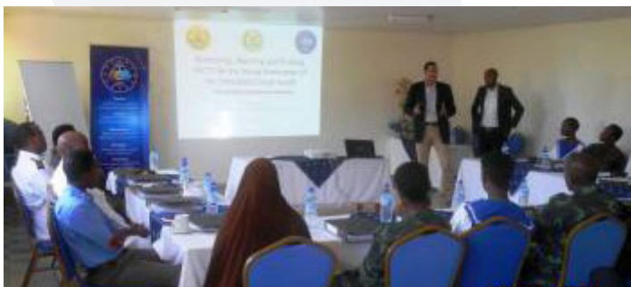
EUCAP Nestor team deliver Mentoring, Teaching and Training Programme to members of the Somaliland Coastguard

As one element of the comprehensive approach of the European Union in the Horn of Africa, the EU's maritime security capacity building mission, EUCAP Nestor , now with an extended mandate until 2016, continues to develop partnerships and deliver training throughout the region. In the framework of an on-going Mentoring Teaching and Training programme - MTT - coordinated by the EUCAP Nestor Somalia office in Somaliland, a 3-day MTT activity for Somaliland young Coast Guard Officers was organized between 26 – 28 August. The MTT, attended by 20 mostly junior officers, provided a foundation knowledge of maritime subjects. In particular, as a result of the EUCAP Nestor training, the young