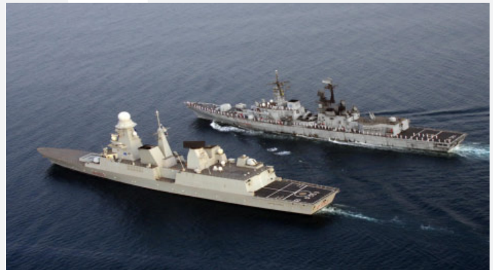
ITS Mimbelli met EU Naval Force Flagship ITS Andrea Doria shortly before she left the area of operations

performed maritime cooperation activities with the Tanzanian Navy, sharing experiences and knowledge on counter-piracy procedures, Maritime Interdiction Operations, force protection capabilities, fire fighting and damage control procedures.