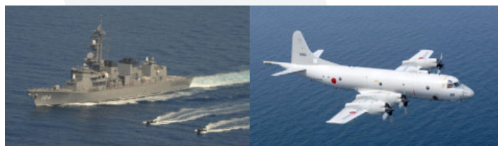
Japanese Destroyer JDS Samidare at sea and P3 Orion MPRA based in Djibouti

In August 2013, the JMSDF decided to extend their efforts and provide MPRA assets. The surveillance provided by these air assets is a crucial element in disrupting and deterring piracy further enhancing their contribution to CMF's operations. As of July 2014, they have undertaken a total of 1,159 flights in support of CMF. Always looking forward, Japan is not content to limit themselves to their current efforts and will take the lead in CMF's counter-piracy efforts by taking command of CTF-151 in 2015.