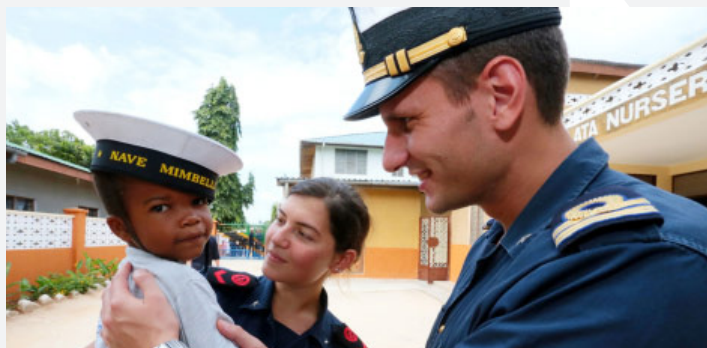
ITS Mimbelli visits an orphanage when on a port visit to Dar Es Salaam during her deployment to Operation Ocean Shield

During her deployment she has sailed more than 32,000 nautical miles and spent 152 days at sea. The Italian ship contributed considerably to maritime capacity building in the region whilst still conducting counter-piracy operations right up to her departure from the area. During a port visit to Dar Es Salaam, Tanzania in late July her boarding teams