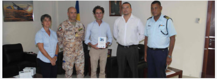
Members of EUCAP Nestor Seychelles Country Team with the Evidence Handling Guide presented to the Seychelles Forces

to deliver basic training and light equipment to the Federal Government of Somalia (FGS) Coast Guard. From a legal perspective, preparations are ongoing for the first EUCAP Nestor Regional Law Drafting Conference to be held on 7-8 October. The aim of the event is to bring together senior law drafting experts from around the Horn of Africa and Western Indian Ocean to share knowledge and best practices to enhance drafting capacities, particularly in relation to maritime security and criminal law.