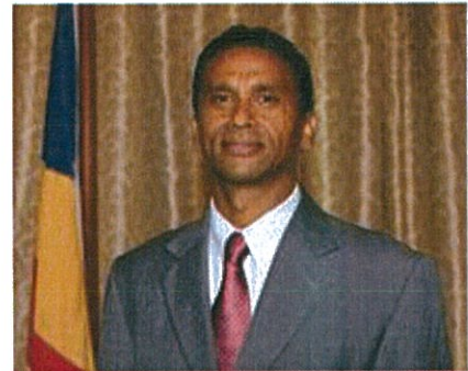
AMBASSADOR BARRY FAURE SECRETARY OF STATE, DEPARTMENT OF FOREIGN AFFAIRS CHAIRPERSON CGPCS 2017