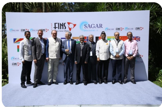
Some Speakers with Team Members of FINS

The attendance of the Chair of the CGPCS was an opportunity to remind the shipping industry and the ocean users that piracy is very much active and that we all need to remain vigilant. There were various ship owners represented at this conference.