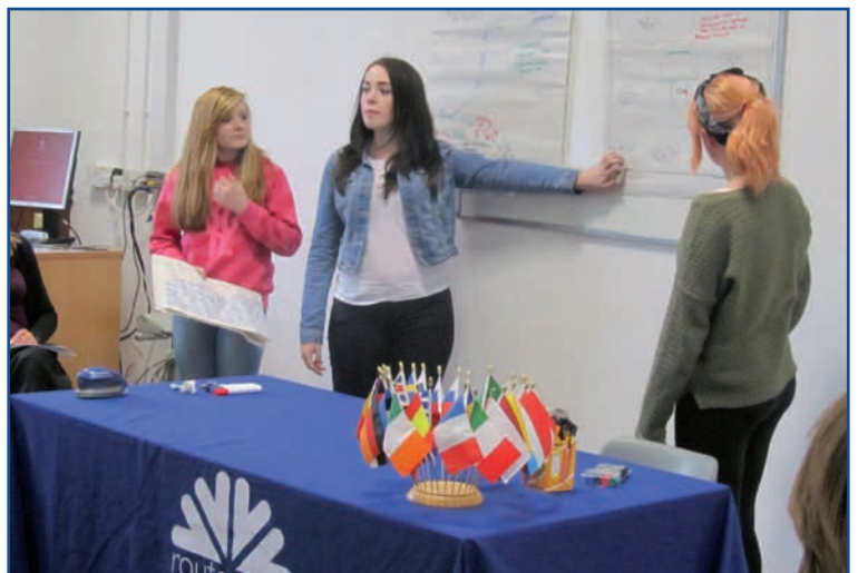
Students present their ideas

and very useful'. All the participants expressed an interest in attending a similar event in future, as well as continuing to learn languages.