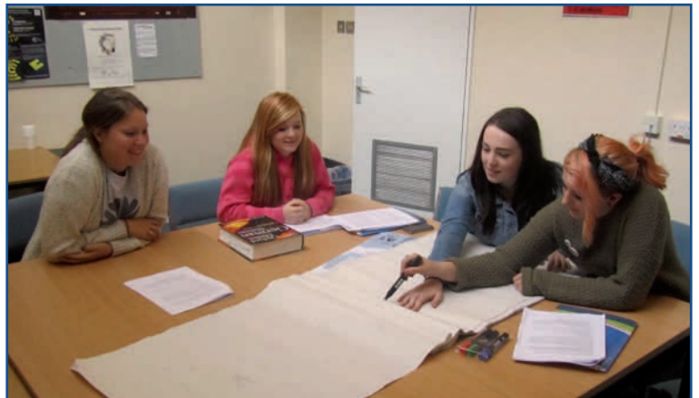
Students design a monument with support from a SLA

Feedback about the event was very positive and both teachers and students acknowledged the standard and relevance of the workshops. They highlighted the fascinating topics and inspiring message. The event was described as 'interesting