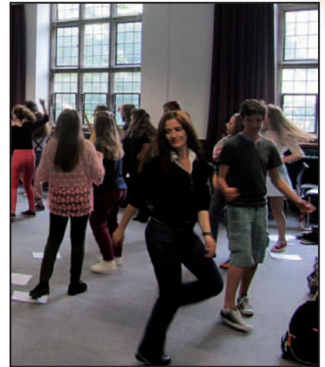
Learning languages through dance