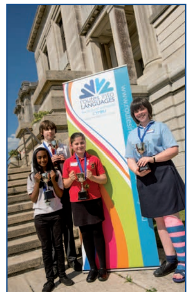
Routes Cymru Spelling Bee champions 2013

This year's Spelling Bee will launch on the European Day of Languages. Keep a look out for more information on our website and also for the brand new resources developed by WJEC that will support the competition.