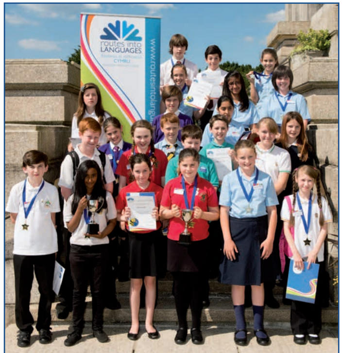
Routes Cymru Spelling Bee competitors 2013

We would like to say thank you to all of the competitors who have taken part throughout the year and also to their teachers and former Spelling Bee competitors, many of whom took on a training role this year, for supporting the competition.